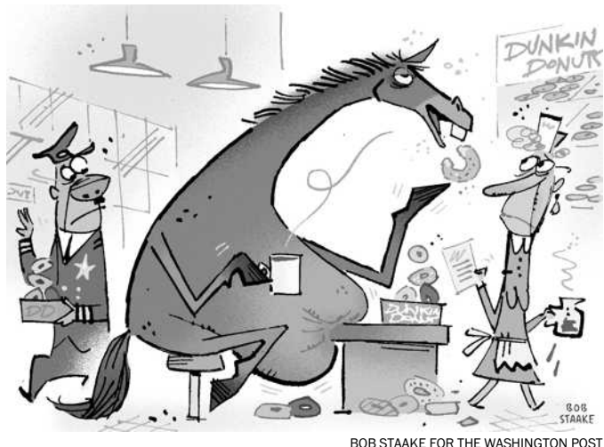
BOB STAAKE FOR THE WASHINGTON POST

April Fool's Day and a USB stick marked "Property of NSA": For